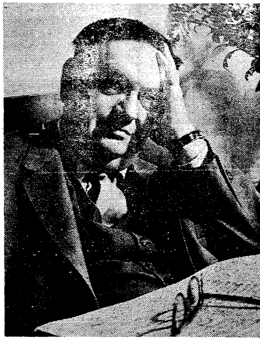
DARIUS MILHAUD AT MILLS COLLEGE He taught there for three decades

Darius Milhaud, the renowned French composer who taught at Mills College for three decades, died in Geneva Saturday at the age of 81, friends of the family said yesterday.